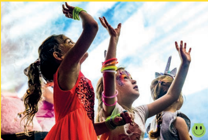
Horniman Family Rave

Tickets: Child £12.50, Adult £15, pre-walking infant free