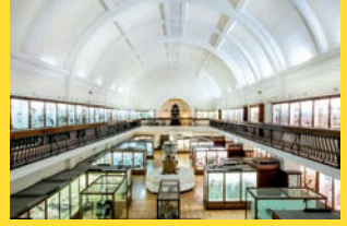
Natural History Gallery