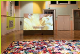
Stages of Making

Step into this immersive exhibition where all the artworks have a story to tell about design, techniques and time. Inspired by the history of the Horniman and its collections, visitors can see works including table tops made from yoghurt pots and a giant rag-rug woven from t-shirts.