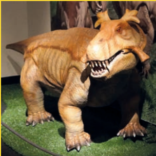
Permian Monsters: Life Before the Dinosaurs