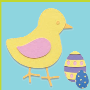
Horniman Easter Fair