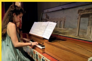
Hear it Live!