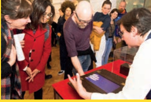
Climate Crisis: Speculative Futures