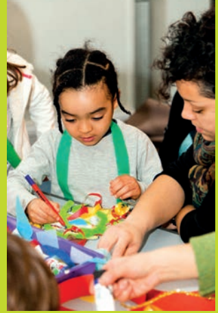
MAKE! Save Our Planet