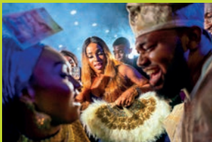
Turn It Up