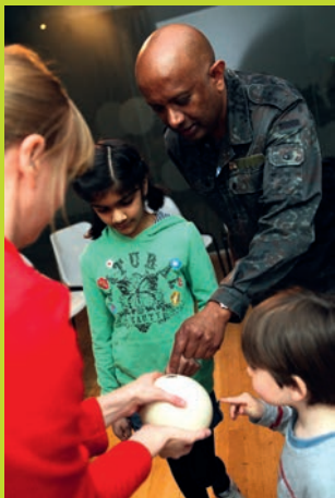
Horniman Explorers