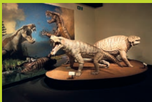
Permian Monsters: Life Before the Dinosaurs

252 million years ago, life on Earth was dominated by extraordinary creatures in a period called the Permian. It was a time of fearsome sabre-toothed predators, giant insects and bizarre-looking sharks. The Permian ended with a mass extinction that destroyed 90% of all life, paving the way for the next great rulers... the dinosaurs.