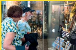
Stay in Tune