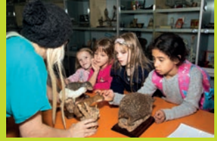
Hands on Base Activities