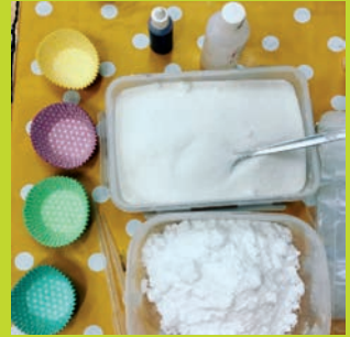
Bath Bomb workshop