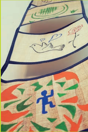
From Birth 'til Death