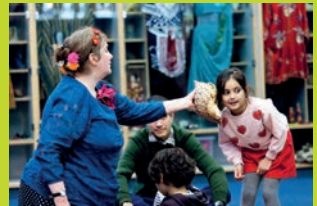
A World of Stories