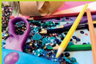
Up in the Air