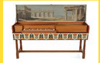
Virginals by Onofrio Guarracino, Naples, 1668.