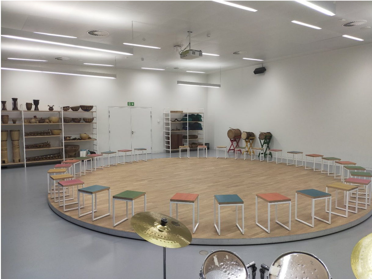
Music Room at the AfricaMuseum, Tervuren, Belgium