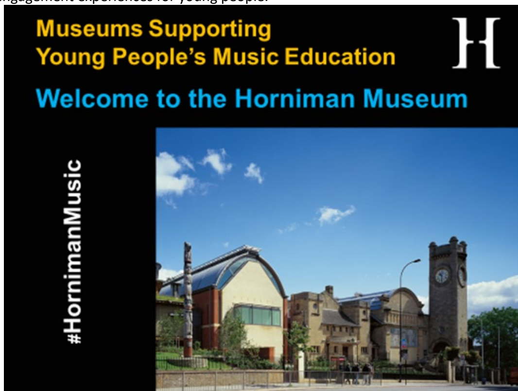
Welcome page to online Seminar