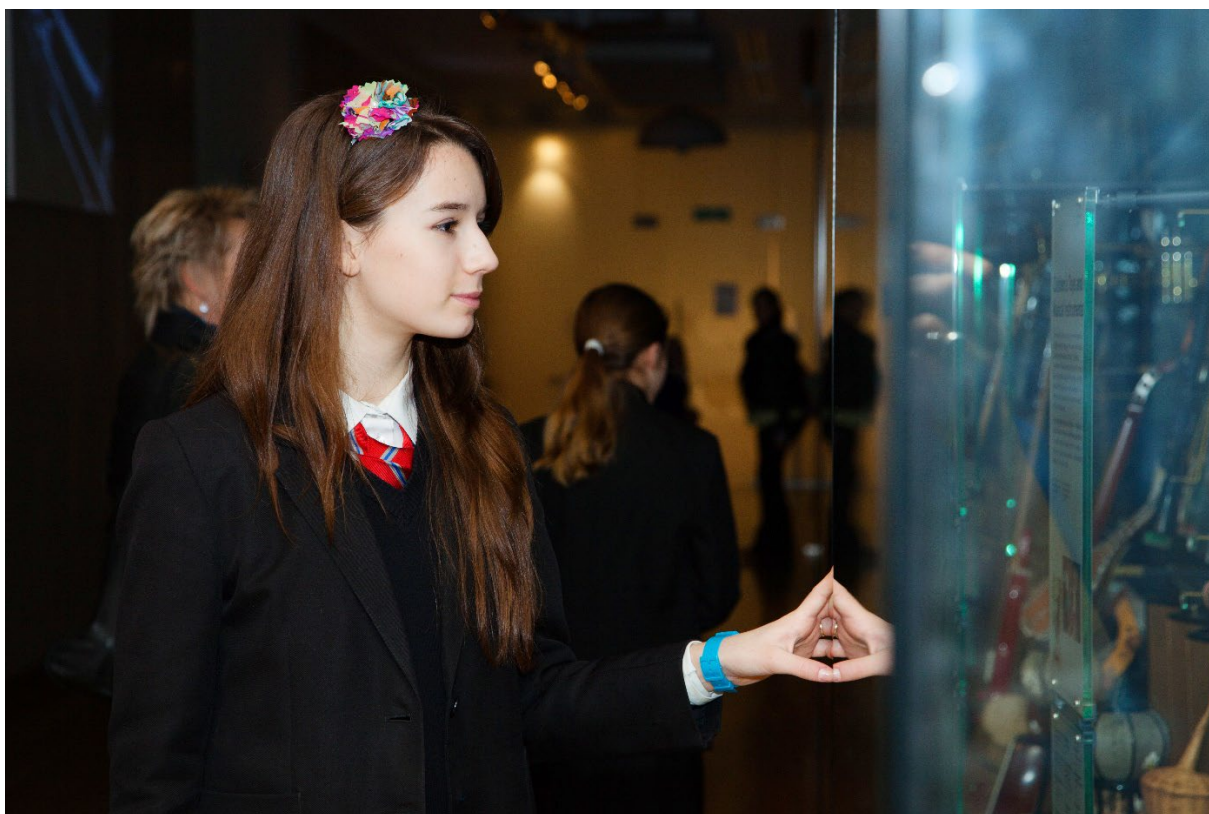
School group in the Horniman Museum's Music Gallery.