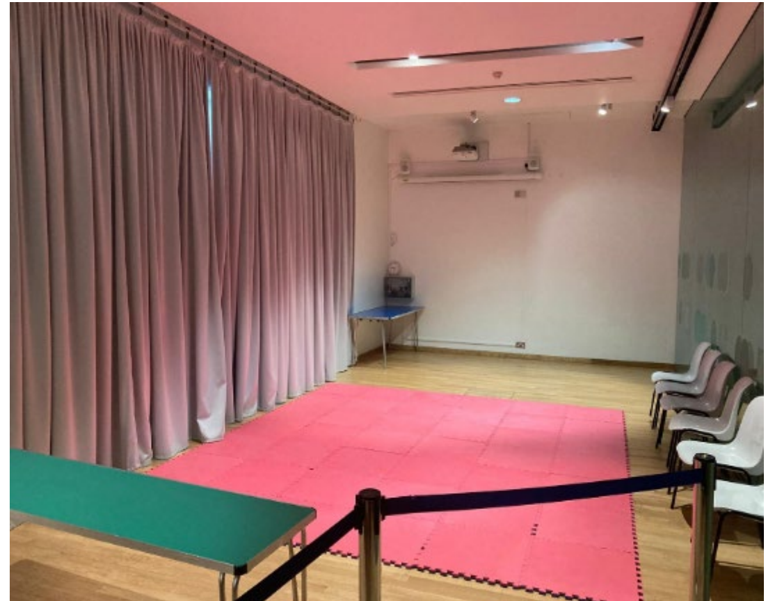
Music Gallery Performance Space