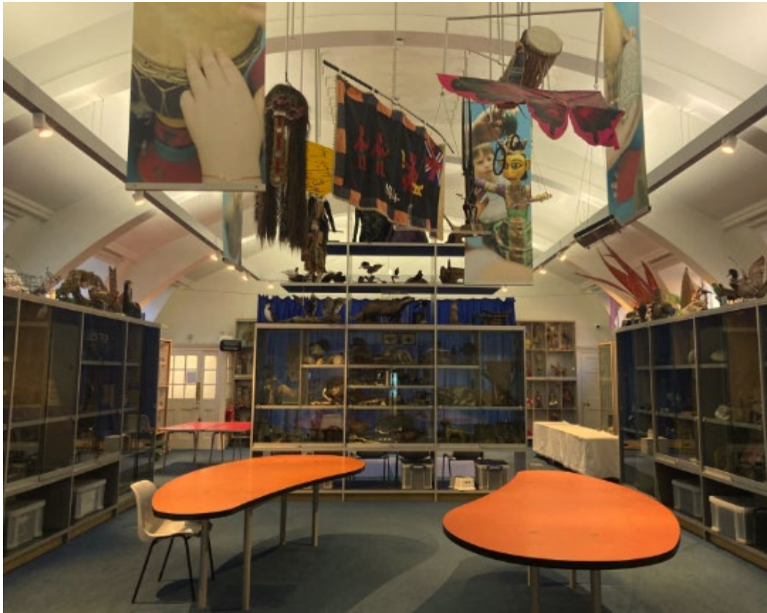
Hands on Base

Your workshop will be in one of these spaces.